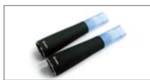
Joye eGo/eGo-T Atomizers Atomizer in tank system, cone shape, no cotton in the tank/cartridge (eGo: the cartridges are Joye eGoA type with cotton)