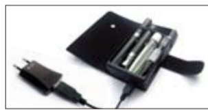
2.6 Joye eGo/eGo-T PCC You can carry 1bottle 10ml liquid, 2pcs eGoB cartridges, 1pcs cigarette without cartridge, 1pcs eGo battery. Customers can carry product according to their needs, and the PCC can charge the battery. (Charging time: 2h) The parameters to charge eGo battery: 4.2V, 200 ma The parameters to charge PCC: 5V, 500mA