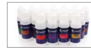
2.8 Joye e-Liquid In conjunction with a working atomizer the liquid gets heated to vapor. There are different flavors available.