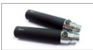
Joye eGo/eGo-T Battery Capacity of battery: 650mAh Constant voltage output: 3.3V With electronic button protection (the eGo battery does not have this function) Charging time: 2Hr minimum