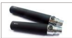
2.1 Joye eGo/eGo-T Battery Capacity: 900mAh, 1000mAh Constant voltage output: 3.3V With electronic button protection (eGo battery does not have this function) Charging time: 900mAh(2h min), 1000mAh(3.5h min)