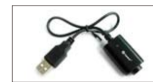
Joye eGo/eGo-T USB Cable Charger Input: 5V, 500mA Output: 4.2V, 420mA