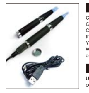
2.3 Joye eGo/eGo-T USB Battery Capacity: 650mAh, 900mAh, 1000mAh Constant voltage output: 3.3V Charging voltage of the usb end: 5V, connecting to the computer or wall adapter through the usb cable. You can use the battery while charging. With electronic button protection (eGo battery does not have this function) 2.4 Joye eGo/eGo-T USB cable Used for eGo and eGo-T USB battery, and to connect to computer or wall adapter.