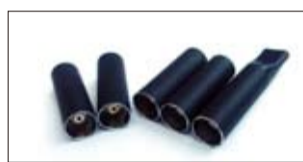
2.2 Joye eGo/eGo-T Atomizers eGo-T B tank / cartridge can hold 2ml of liquid (eGoB cartridge can hold 2.5 ml liquid)