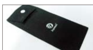
Joye eGo pouch Cloth case for convenient carrying of your ecig and parts.