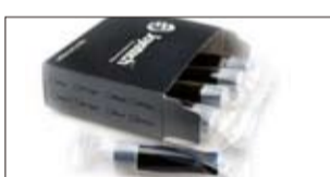
Joye eGo/eGo-T Cartridge eGo-T A type tank / cartridge can hold 1ml liquid (eGoA type cartridge can hold 1.5ml).