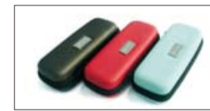
2.7 Joye eGo Carrying Case For convenient carrying of product while you are out. You can carry 2pcs cigarettes, 1pcs usb charger, 2pcs cartridges, and 1bottle 10ml liquid. Or carry products according to your need.