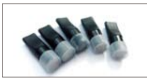
2.5 Joye eGo/eGo-T Cartridges eGo-T B tank / cartridge can hold 2ml of liquid (eGoB cartridge can hold 2.5 ml liquid).