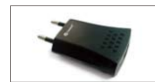
USB Wall Adaptor Input: 100-240V 50/60Hz, 100mA Output: 5V, 500mA